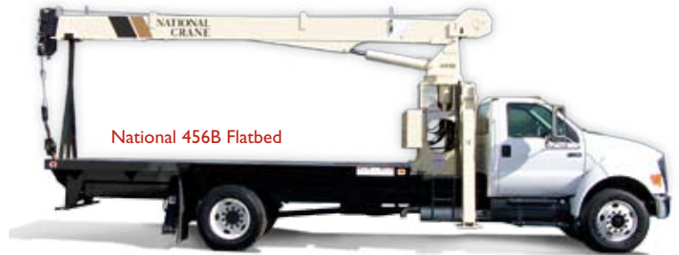
National 456B Flatbed

National is the finest telescopic type crane in the world. It is the benchmark for quality and reliability. UTE has been mounting these cranes for over 20 years. The latest package features the 400 series boom on a non-CDL chassis with 66' of sheave height. Optional jibs, radio controls, work baskets and much more are available.