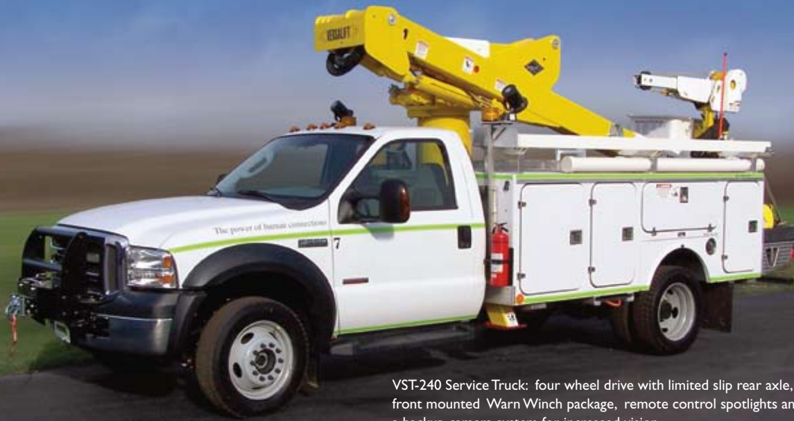
VST-240 Service Truck: four wheel drive with limited slip rear axle, a front mounted Warn Winch package, remote control spotlights and a backup camera system for increased vision.