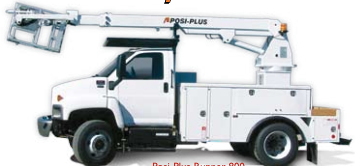
Posi-Plus Runner 800

A multi-functional aerial unit for cable installation and maintenance, LineRunner Cable Placers are designed for extended reach and built for optimized operator performance.