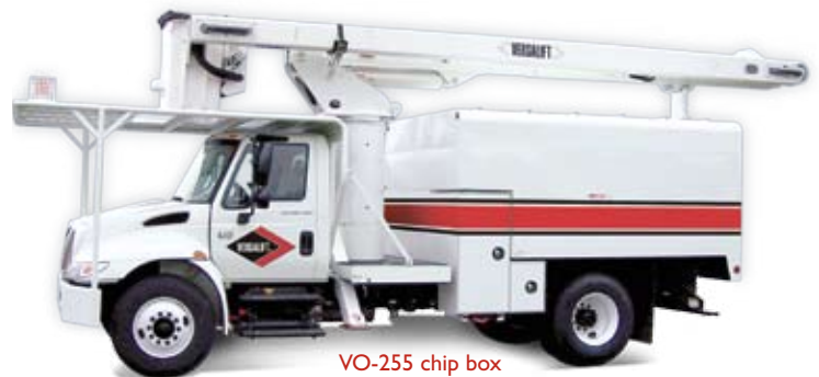
VO-255 chip box

VO Series: Versalift has a full line of articulated, overcenter bucket trucks and aerial devices ranging in height from 36' to 65', including forestry units with over 50' of horizontal reach, and heavy-duty material handlers for electric utility operations. All of these units are rugged and dependable. No cables are used in the aerial device for lower maintenance and increased operator safety. More information on this product line at www.utilitytruck.net/artover.html